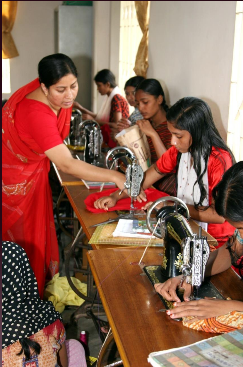
Sewing and embroidery class