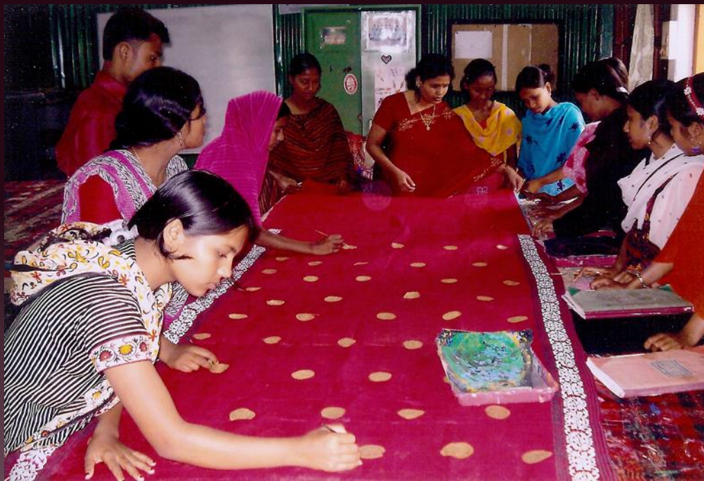
Block printing class

Make them skill-full so that they can come out of economic poverty