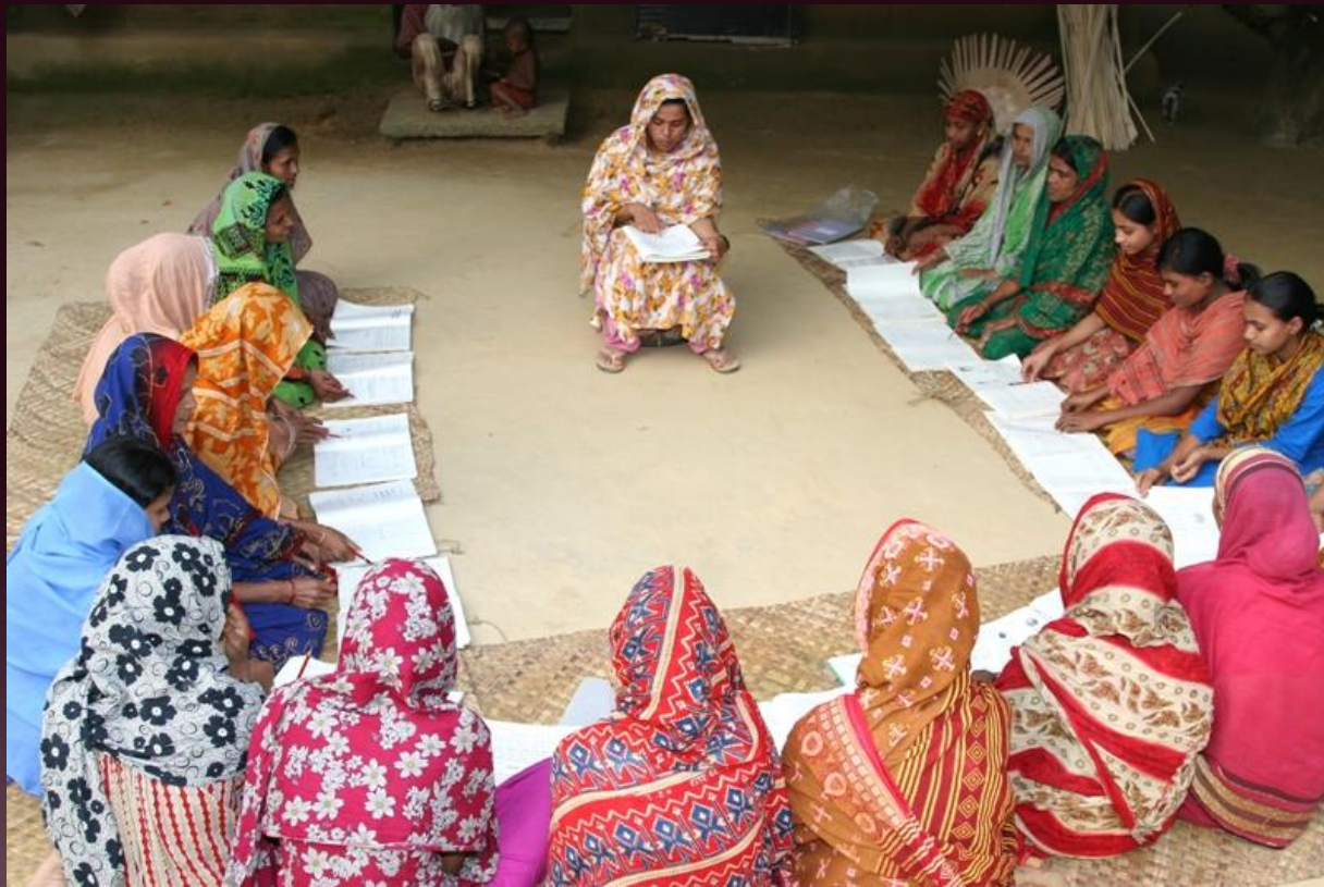
Female adult literacy class

Give them the first introduction to the letters and numbers