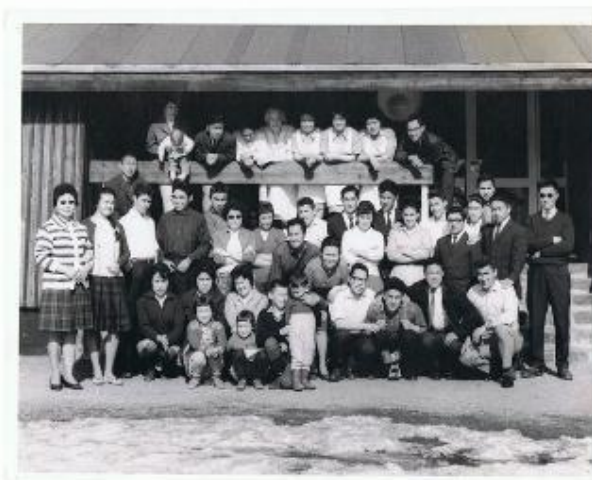
First student from 1962

Knud Rasmussen, polar explorer and writer said it better than any other: