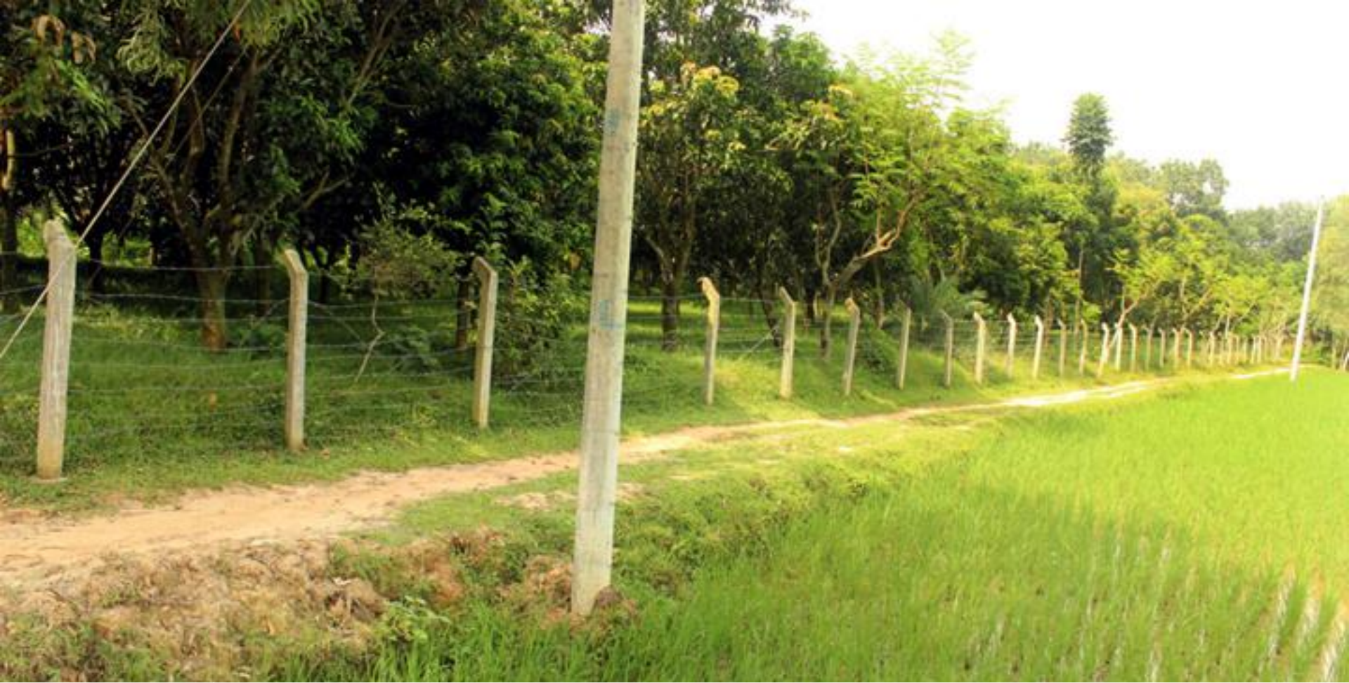
Mango garden and paddy cultivation