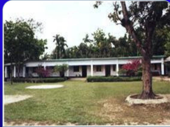
Panchagram Gonobidyalya, Shahrasti, Chandpur