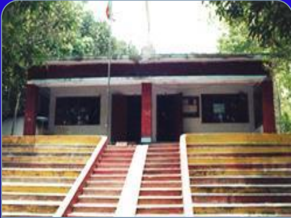
Rangunia M.A.Chashi Gonobidyalaya, Chittagong