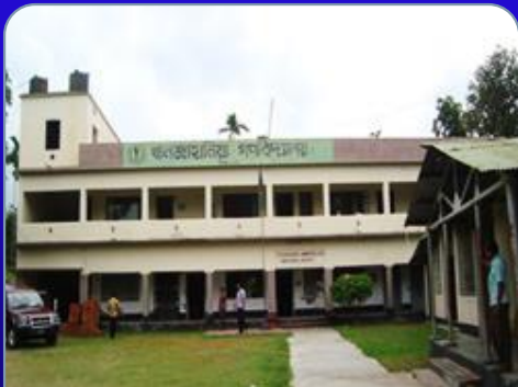
Khan jahania Gonobidyalaya, Bagerhat