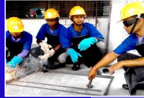
Vocational & Livelihood Training