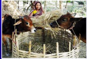
Micro finance/ Credit program