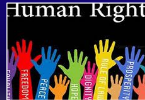
Rights & Advocacy