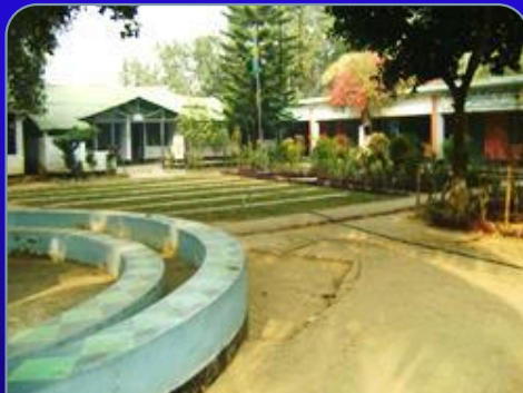
Uchai Gonobidyalaya, Panchbibi, Joypurhat